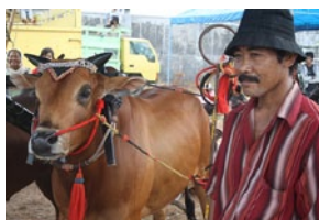
At kerapan sapi , Madura bull races, contestants use sorcery and magic to gain

The Madura are known for anger and violence. They may seek blood revenge when offences are committed against them, especially when adultery, cattle theft or public loss of face are involved. Blood revenge is exacted through the practice of carok with a sickle-shaped knife. A carok attack is usually fatal.